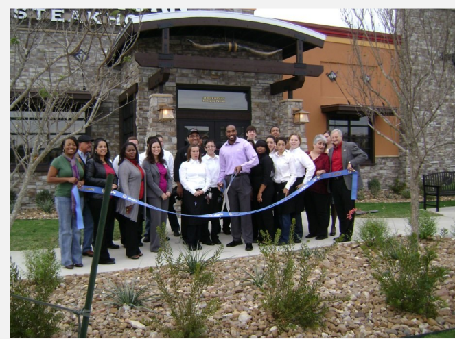
Left—A ribbon cutting was held at Longhorn Steak House, located at 6201 E. Sam Houston Pkwy., N., on December 14.