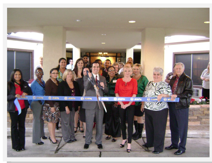
Left—A ribbon cutting was held at the newly renovated Silver Springs Healthcare Center, located at 12350 Wood Bayou Dr., on December 17.