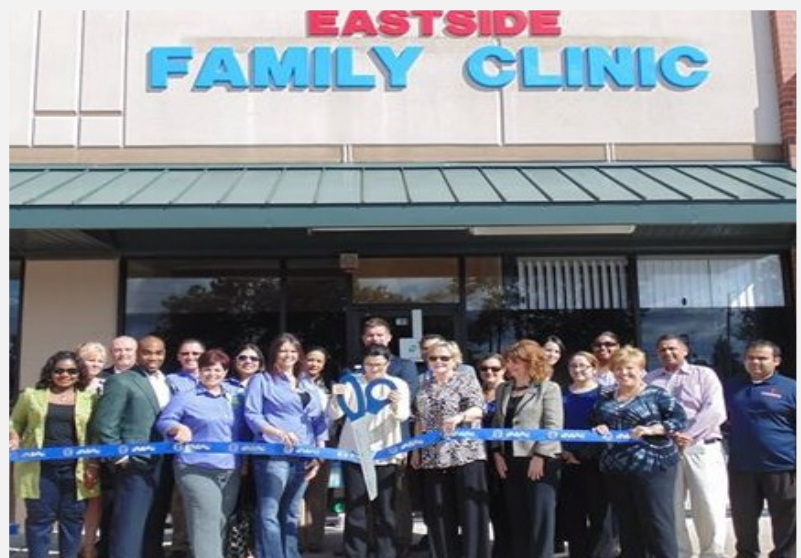
Pictured right: East Side Family Clinic located at 15119 Wallisville Rd, Houston, TX. 77049

If you would like to schedule a ribbon cutting, please call the Chamber office at 713-450-3600