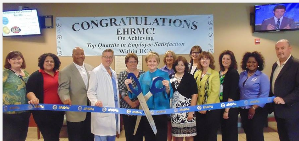
Pictured left: East Houston Regional Medical Center's newly renovated Emergency Room. 13111 East Freeway, Houston, TX. 77015