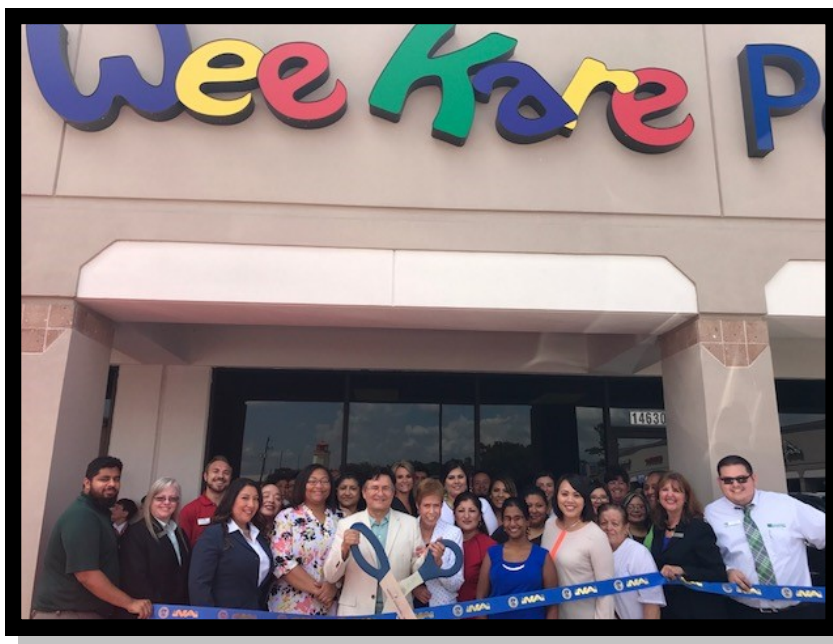
A ribbon cutting was held for WeeKare Pediatrics on July 12. They are located at 14630 Woodforest Blvd., 77015.