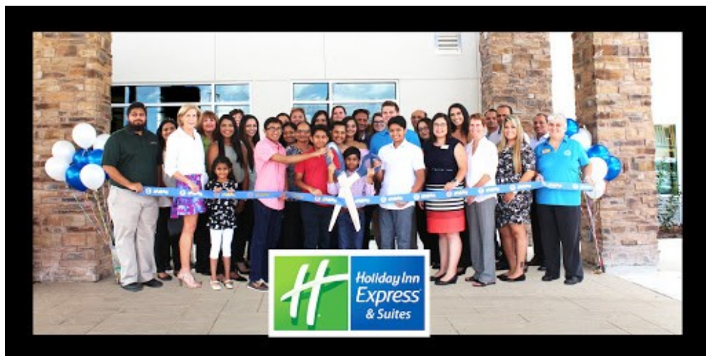
A ribbon cutting was held for Holiday Inn Express Houston East on July 19. They are located at 6175 E. Sam Houston Pkwy. N., 77049.

The North Channel Area Chamber of Commerce's mission is to promote economic development and provide real solutions for business and community prosperity.